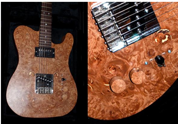
Electric Guitar Knobs

I built a small work bench and added two drawers to help me misplace stuff. Instead of making knobs I decided to try this idea. The Drawer Pulls are made from a circle 4\frac{1}{2} " X 1\frac{1}{4} ". I mounted the circle on a