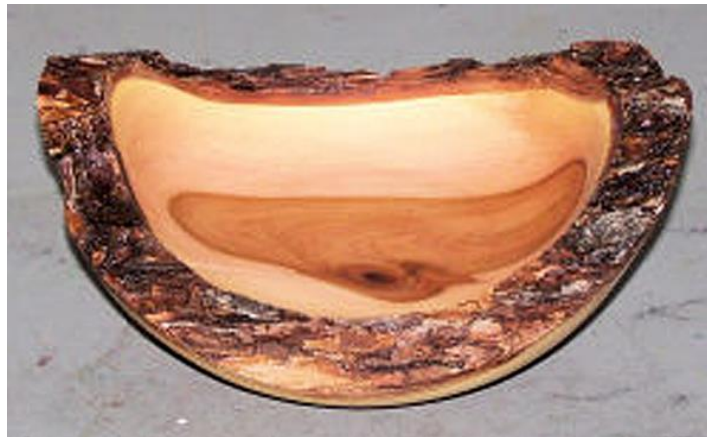
Natural/Live edge bowl Ken Crosby

Before the lathe is turned on, ensure that all clamps and fittings are secure and that the work piece is free to turn.