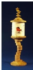
A couple of my turnings